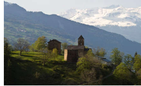
Landscape in Domleschg