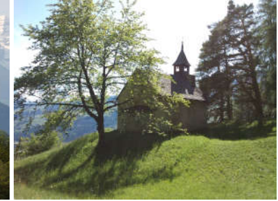
Chapel St. Maria Magdalena, Paspels